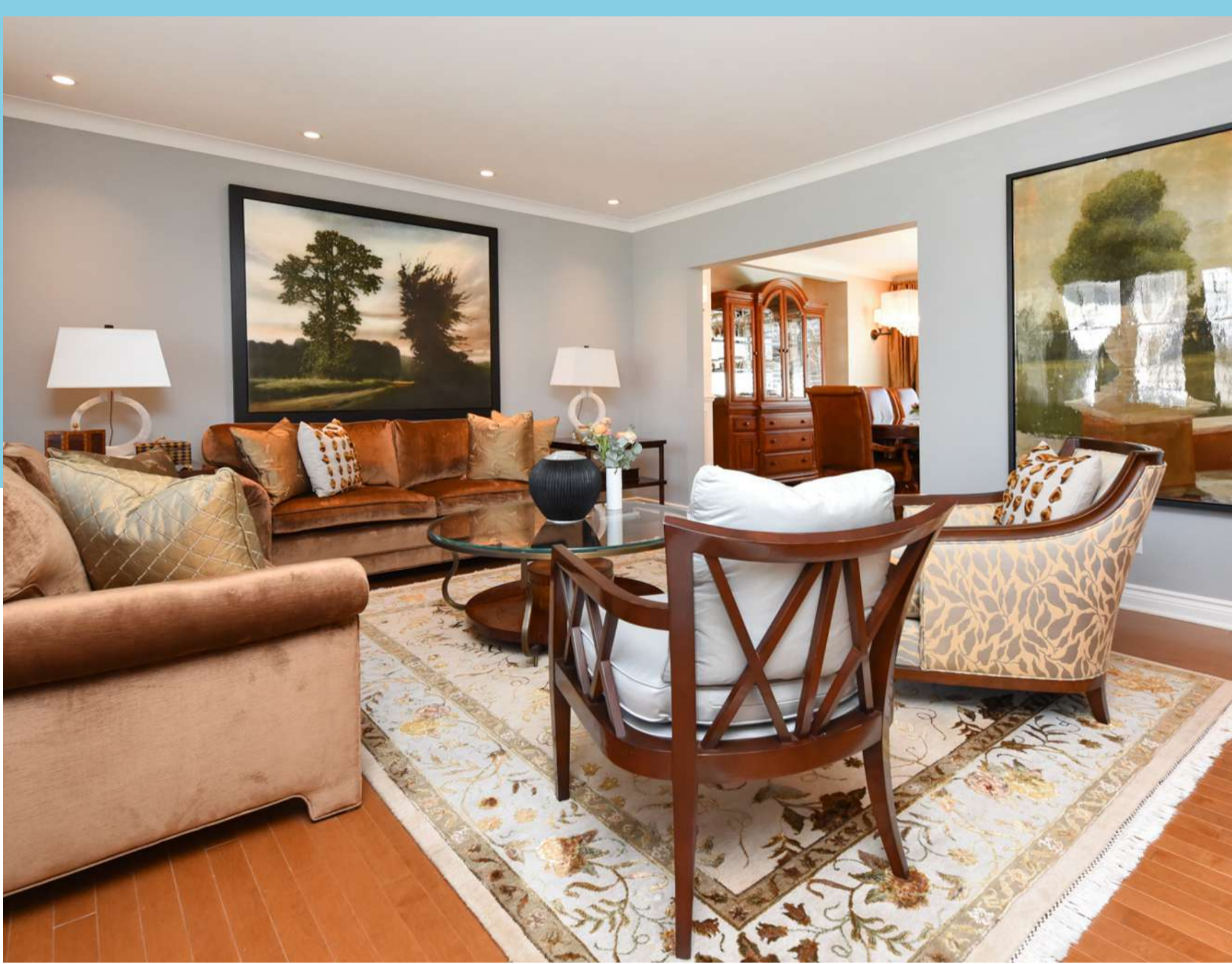
📍 2379 Whitehaven Crescent